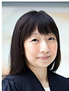
JUSTICE MAVIS CHIONH High Court Judge, Singapore Supreme Court

Centre for International Intellectual Property Studies (CEIPI), Strasbourg, the Munich Intellectual Property Law Center (MIPLC), and the Universities of Catania and Krakow.